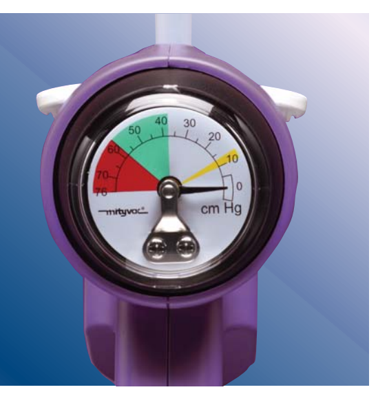
Easy-to-read color-coded gauge