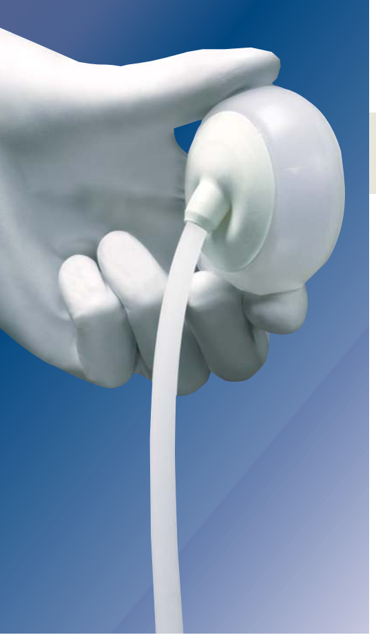
New low-profile M-Style cup